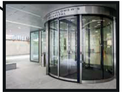
King Edward Street Entrance

Pedestrian only access from Giltspur St or West Smithfield